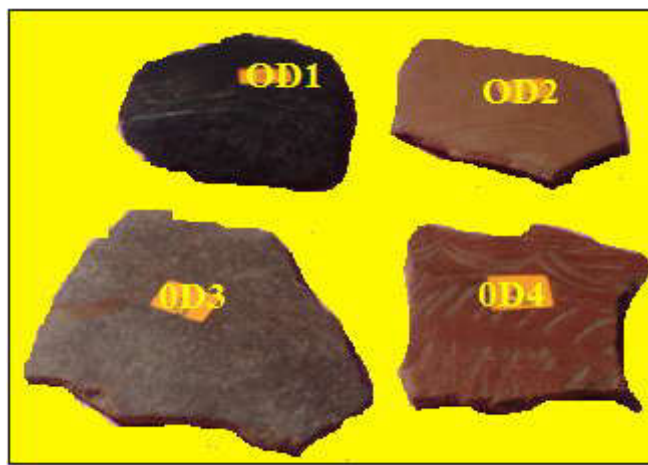
Figure 1. The ancient potteries of Odugathur, Vellore dist

The pottery samples were recovered from the site Odugathur village of Vellore Dist (lat. 13° 48'N; long 80° 10'E). The samples were collected at 8m from the surface of the soil. The pottery shreds of Odakathur village belonging between 100BC and 300 AD in South India. Red slipped ware was collected in the site. All the fragments collection is different in variety and colors. The typical collection of pottery samples is shown in Figure 1. The samples are labelled as OD1, 2, 3 & 4. After removal of surface layers, the pottery shreds were ground into fine powder using agate mortar. This fine powder is used for different analyses.